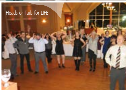
Heads or Tails for LIFE